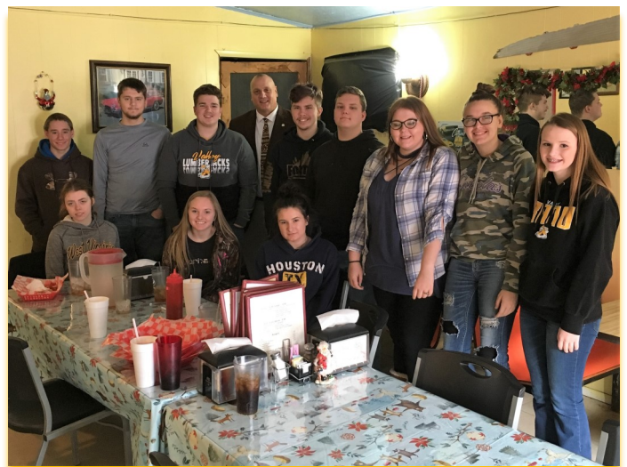
Valley High School