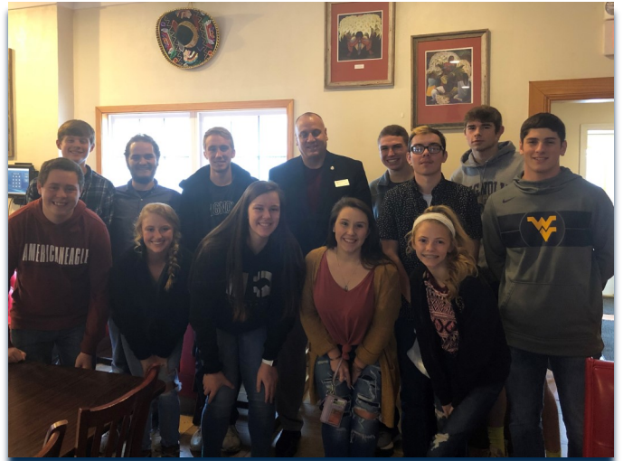
Magnolia High School