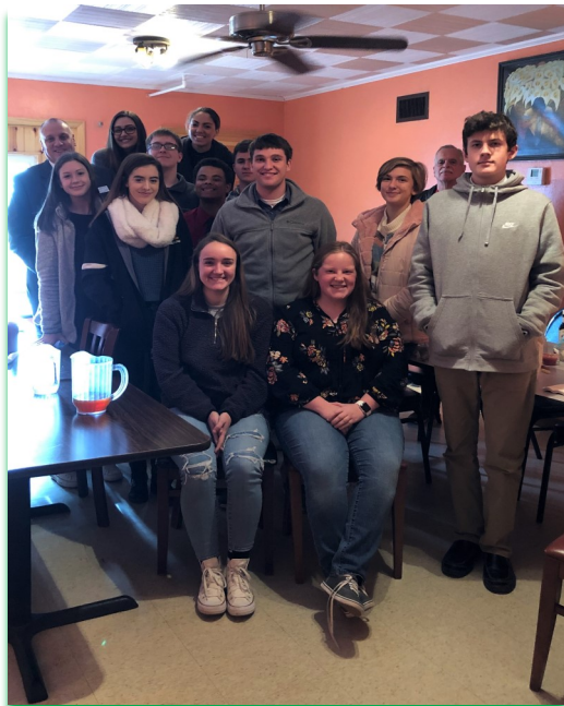
Paden City High