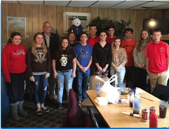
Hundred High School